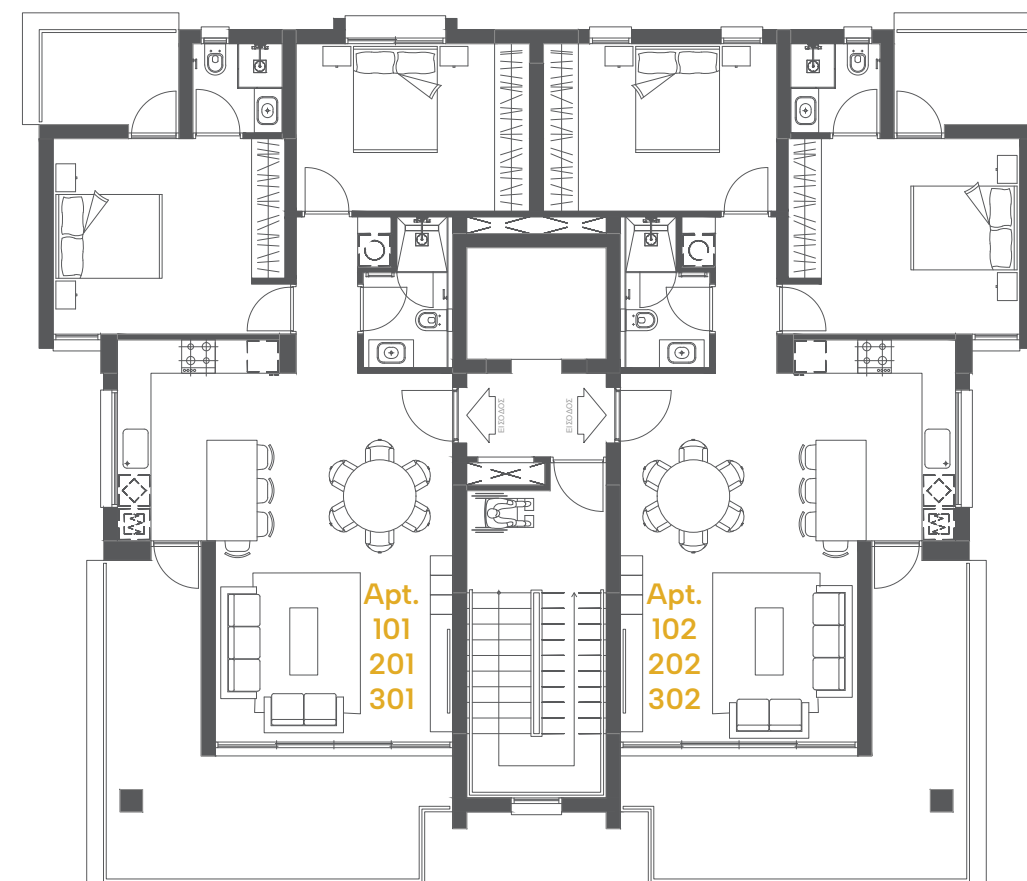
TYPICAL FLOOR PLAN (FLOORS 1,2,3)